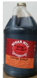
Item SCOF* J. Hungerford Smith Coffee Syrup Fountain/Shake 4/1GAL Bottles