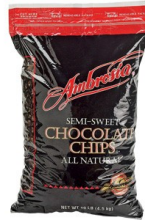
Item CHOCHIP Ambrosia Chocolate Chips Pure 10# Case