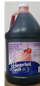
Item SSTRAW* J. Hungerford Smith Strawberry Syrup Fountain/Shake 4/1GAL Bottles