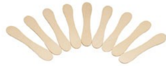
Item GX1090* Goldmax Wooden Spoon Bulk 100/100 Bags

Vollrath Stainless Steel Dishers Color-Coded VO47139: #6, 5.33 OZ, WHITE VO47140: #8, 4.00 OZ, GREY VO47141: #10, 3.25 OZ, IVORY VO47142: #12, 2.67 OZ, GREEN VO47143: #16, 2.00 OZ, BLUE VO47144: #20, 1.625 OZ, YELLOW VO47145: #24, 1.33 OZ, RED VO47146: #30, 1.00 OZ, BLACK VO47147: #40, 0.75 OZ, ORCHID VO47159: #60, 0.5625 OZ, SQUEEZE