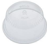
Item SOSDL58* Solo Ice Cream Cup Lid Plastic (Fits 5 & 8 OZ) 20/50 Sleeves