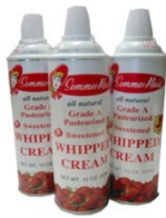
Item WHIP* Packer Whipped Cream Aerosol 12/14OZ Bottles