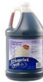
Item SVAN* J. Hungerford Smith Vanilla Syrup Fountain/Shake 4/1GAL Bottles

*items sold by the case or by the individual container