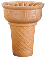
Item KE80022 Keebler Elves Ice Cream Cone Jacketed Cake Cup 6/100