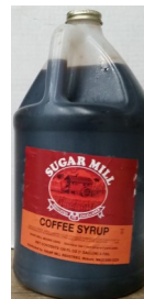
Item SCOF* J. Hungerford Smith Coffee Syrup Fountain/Shake 4/1GAL Bottles