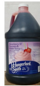
Item SSTRAW* J. Hungerford Smith Strawberry Syrup Fountain/Shake 4/1GAL Bottles