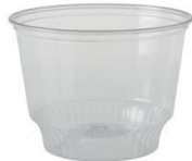
Item SOSD8* Solo 8 OZ Ice Cream Cup Plastic 20/50 Sleeves