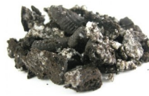
Item KF00073* Nabisco Oreo Cookie Medium Pieces 4/2.5# Bags