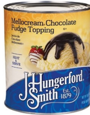
Item MELLO* J. Hungerford Smith Mellocream Fudge RTU Topping 6/10 Cans