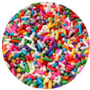
Item JIMA* Azar Jimmies Assorted 4/6#