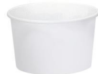
Item SOVS508* Solo 8 OZ Ice Cream Cup Paper 20/50 Sleeves