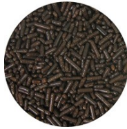
Item JIMC* Azar Jimmies Chocolate 4/6#