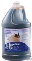
Item SCHOC* J. Hungerford Smith Chocolate Syrup Fountain/Shake 4/1GAL Bottles