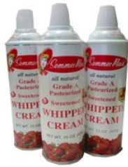
Item WHIP* Packer Whipped Cream Aerosol 12/14OZ Bottles