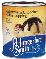
Item MELLO* J. Hungerford Smith Mellocream Fudge RTU Topping 6/10 Cans