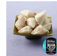
PF15123* Phillips Crab Meat Culinary Lump 6/1# Cans