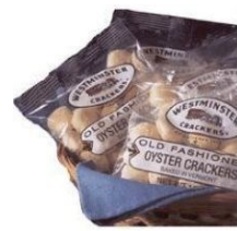
WC15040 Westminster Oyster Crackers .5 OZ Packets 150 Count