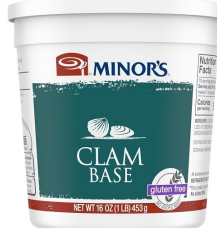
NF64906* Minors Soup Base Clam 6/1# Containers

*items sold individually by the piece, bottle, bag, etc.