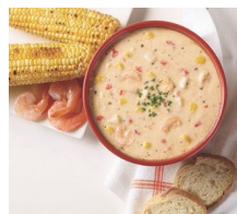
BS77023 Blount Foods Shrimp & Corn Frozen 4/4# Bags