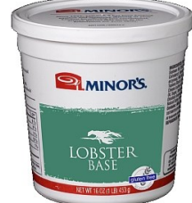
NF21006* Minors Soup Base Lobster 6/1# Containers