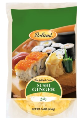
RL60370* Roland Ginger Sushi Natural 12/1# Bags

*items sold individually by the piece, bottle, bag, etc.