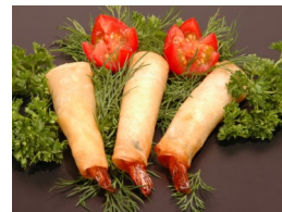
LC154 Les Chateaux Shrimp In Spring Roll 100 Count