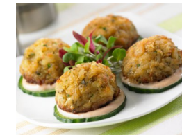
PF35031 Phillips Crab Cakes Chesapeake 100/.75OZ

*items sold individually by the piece, bottle, bag, etc.