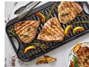
FSSWRD8 Packer Swordfish Steaks Boneless, Skin On 20/8 OZ Steaks