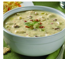
BS77076 Blount Foods Scallop & Bacon Frozen 4/4# Bags