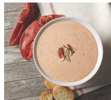
BS75030 Blount Foods Lobster Bisque Refrigerated 4/4# Bags