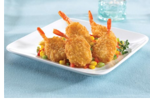
MF59121* Mrs. Friday's 16/20 Shrimp Breaded 4/3# Boxes