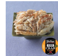
PF15402* Phillips Crab Meat Claw 6/1# Cans