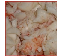
FSLOBMT Seamaz Lobster Meat Claw & Knuckle 6/2# Bags