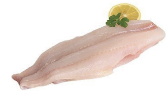
FSHAD810 Packer Haddock Fillets 8—10 OZ Fillets 10# Case