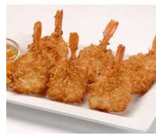
SIN23908* Tampa Maid 21/25 Shrimp Coconut Breaded 4/2.5# Bags