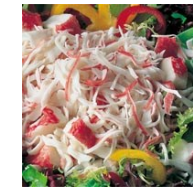
TR12027 Trident Sealeg Supreme Salad Style 2/5# Bags