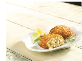
IL4302 Icelandic Crab Cakes Maryland 48/3 OZ