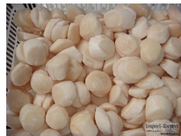
FSSC3040 Alpha Seas Scallops IQF 30/40 2/5# Bags