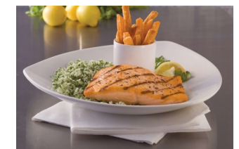
TR421348 Trident Salmon Fillets IQF 20/8OZ Fillets

*items sold individually by the piece, bottle, bag, etc.