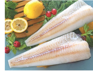
FSCOD5 Packer Pacific Cod Loins 5 OZ IQF 10# Case