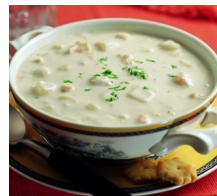
BS75090 Blount Foods N.E. Chowder Refrigerated 4/4# Bags