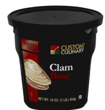
CU95171* Custom Soup Base Clam 6/1# Containers