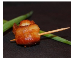
LC43 Les Chateaux Scallops Wrapped in Bacon 100 Count