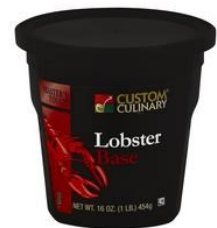
CU95101* Custom Soup Base Lobster 6/1# Containers